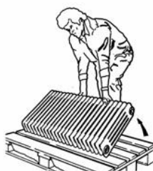
ALWAYS! Lift in centre