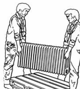
ALWAYS! Keep sections vertical