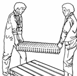
DO NOT! Carry radiators flat